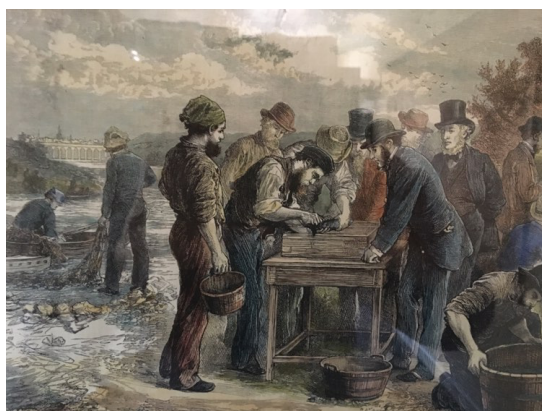
Colourised 1873 tagging engraving

This was a landmark development in salmon conservation and river management, recognising the need to balance commercial fishing interests in the lower river with the protection of salmon migration and spawning habitat throughout the wider catchment.