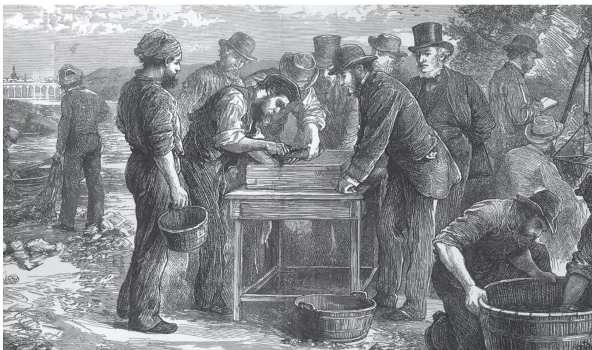
Tagging of salmon on the River Tweed at Heughshiel by the Experimental Committee of the RTC, 1873